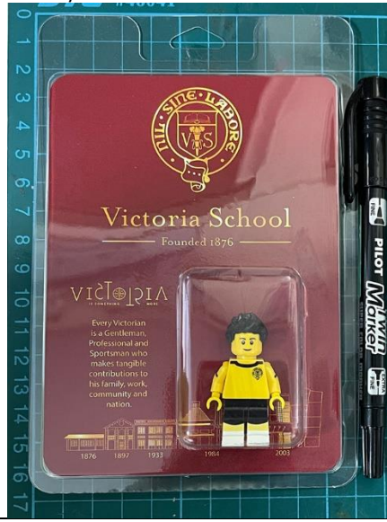
Lego Minifigure (Bumble Bee PE attire)