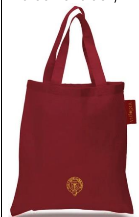
A4 Tote Bag (available in maroon or black)