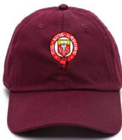
Cap (available in maroon or black)