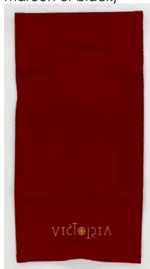
Sports Towel (available in maroon or black)