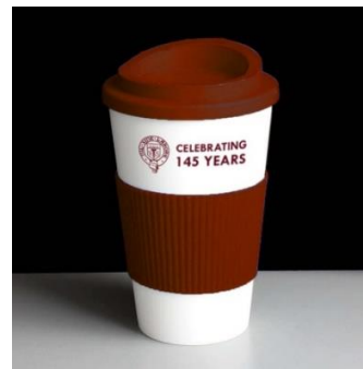
Reusable Coffee Mug