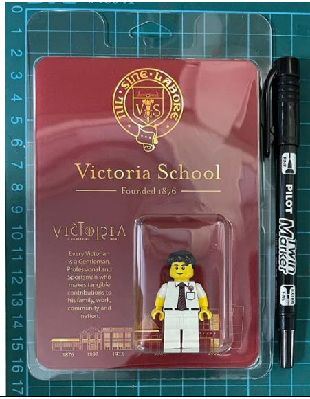
Lego Minifigure (Full Uniform)