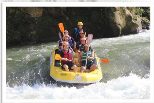
Rafting at Bah Bolon River, North Sumatera

*Due to Covid-19 situation, overseas immersion is subject to MOE's approval