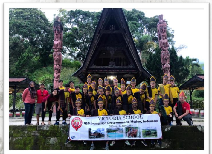
RSP Cultural Immersion to Medan, Indonesia, November 2019

The Regional Studies Programme aims to instill an awareness and familiarity with our home region. Through their participation in the programme, students will be enriched with the knowledge and insights that will better position them to take advantage of opportunities in a globalised world.