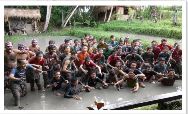
Mud Wrestling, Traditional Martial in Bali